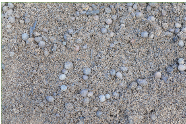
Boughton Loam Ltd

Boughton Intensive Green Roof Substrate 1 meets and exceeds all present G.R.O guidelines.