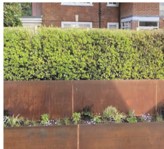
Holm Oak provides an ideal backdrop and privacy screen in an urban setting.